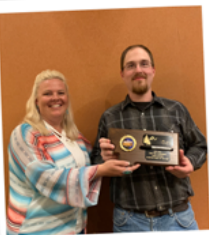
SHARPEST KNIFE OF THE WEST