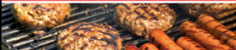
Hot Dogs & Hamburgers