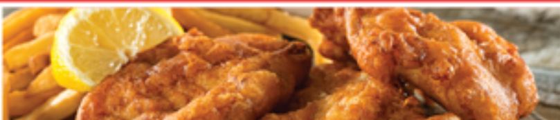
Fish & Chips