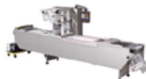
Rollstock RI-200 Packaging Machine