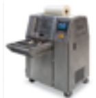
Ross Tray Sealers