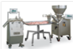
Vemag Sausage Linkers and Link Cutters