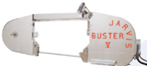
Buster V Carcass Splitting Bandsaw for Beef