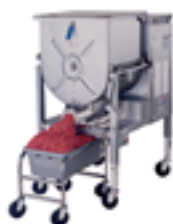
Hollymatic 180A Mixer/Grinder

WE'RE IN THIS TOGETHER For All of Your Processing & Packaging Needs