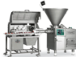
Vemag Gourmet Patty Formers