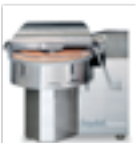
Seydelmann Bowl Choppers

Nobody does meat processing and packaging better than Reiser .