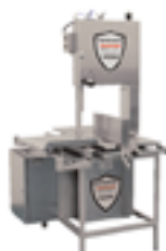
Hollymatic Defender 4000 Band Saw