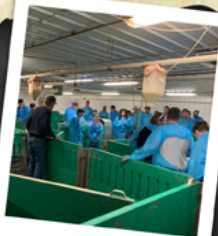
ON A TOUR