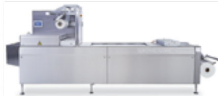
Reiser Form/Fill/Seal Packaging