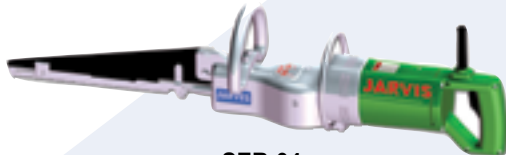
SER-04 Reciprocating Breaking Saw