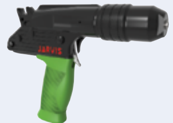
Model PAS - Type P Power Actuated Stunners